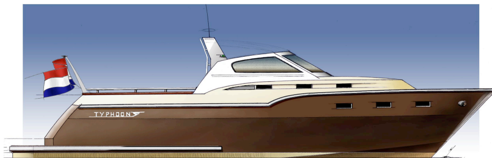
TYPHOON 45 Spider